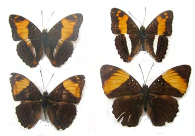
Fig. 4. Hybrids (left) of A.p. pseudoaethalia x A. l. melanthe