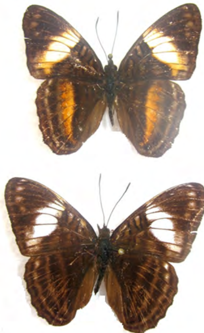
Fig. 2 hybrid (above) of A. ethelda x eponina