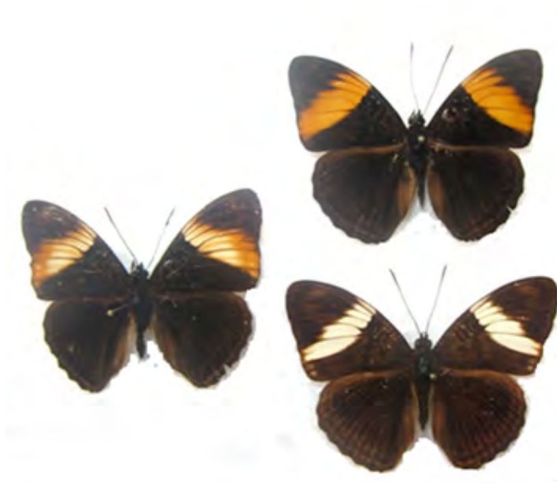
Fig. 3. Hybrid (left) of A.l. wallissii x A. l. melanthe